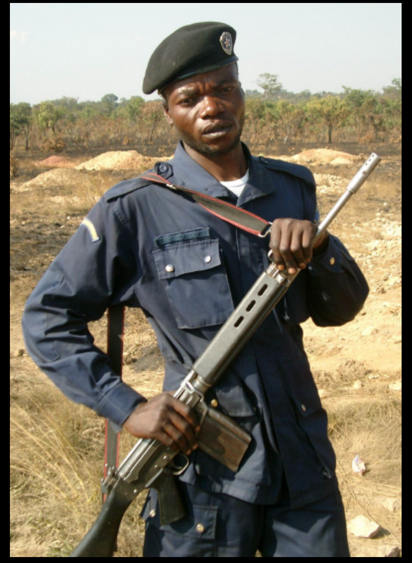
Security around around Likasi Cu-Co mine, République Démocratique du Congo