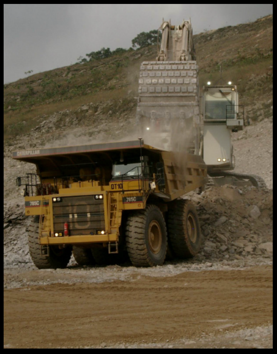
Tarkwa open pit gold mine, Gold Fields Ltd, Ghana