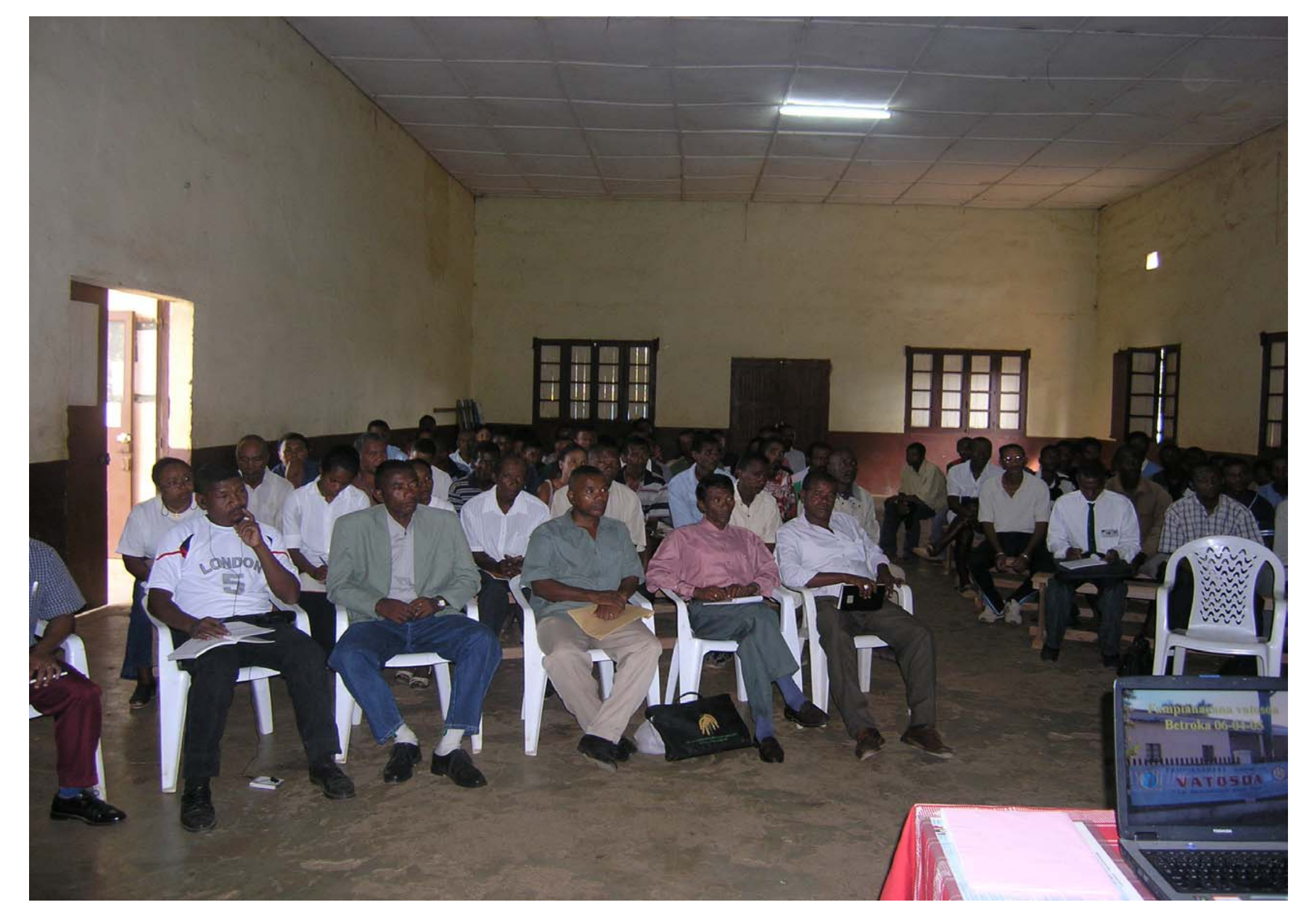
GEMOLOGY COURSE LECTURED IN MALAGASY IN BETROKA