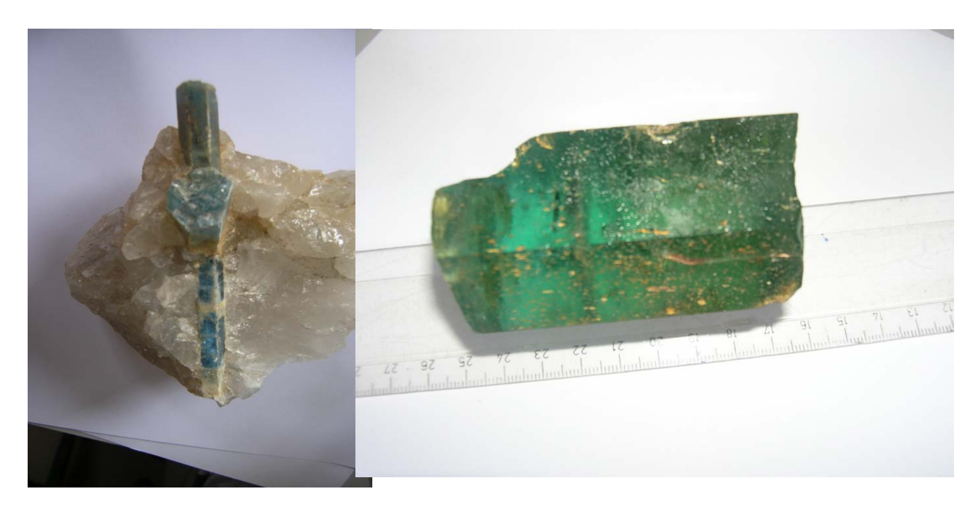
BERYL: AQUA MARINE AND EMERALD