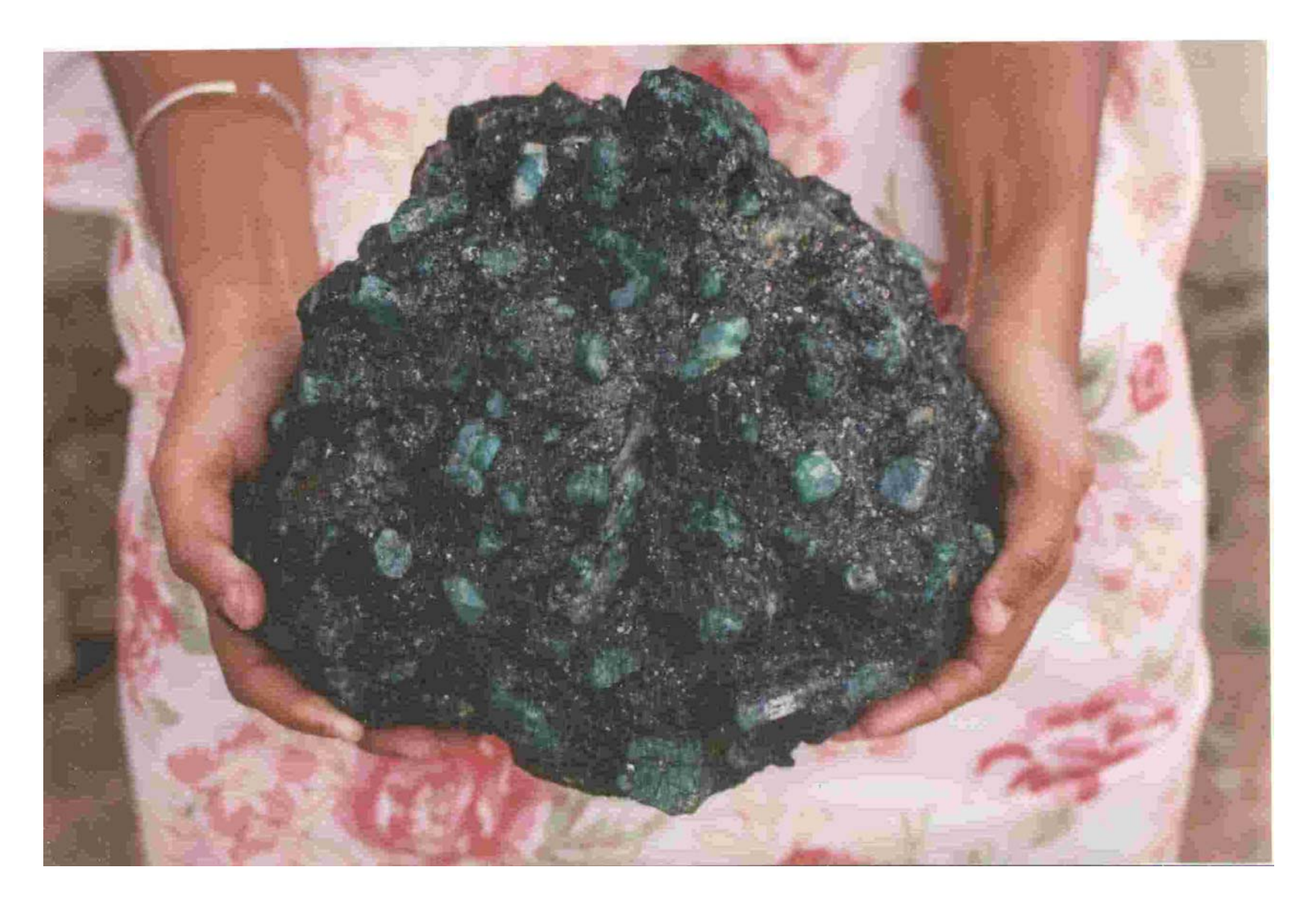
EMERALD CRYSTALS IN MAFIC BIOTITE SCHIST HOST ROCK FROM THE SOUTH-EASTERN MADAGASCAR