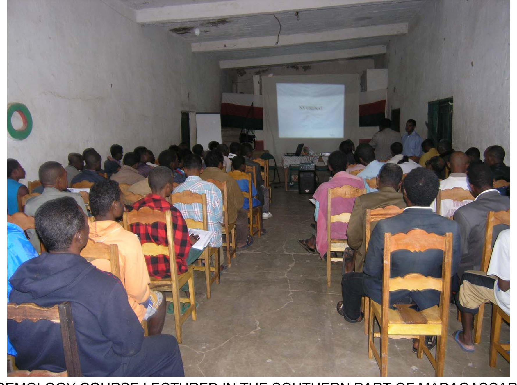
GEMOLOGY COURSE LECTURED IN THE SOUTHERN PART OF MADAGASCAR