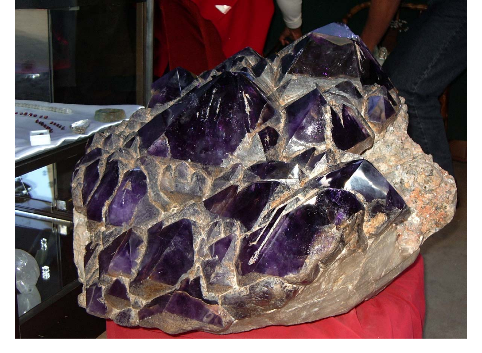
LARGE AMETHYST CRYSTALS