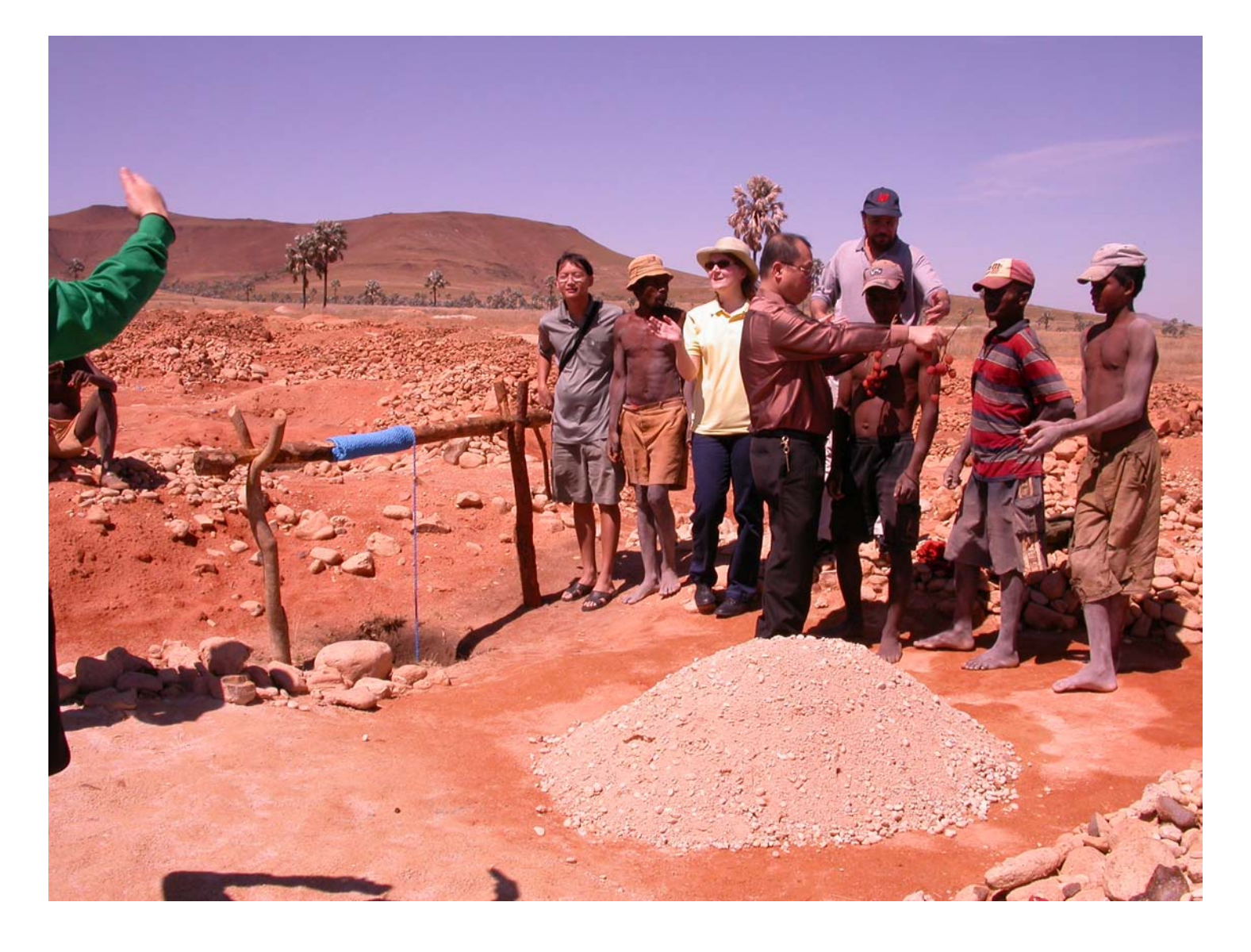
SAPPHIRE MINERS AND THAI GEM BUYIERS IN ILAKAKA – SOUTHERN MADAGASCAR