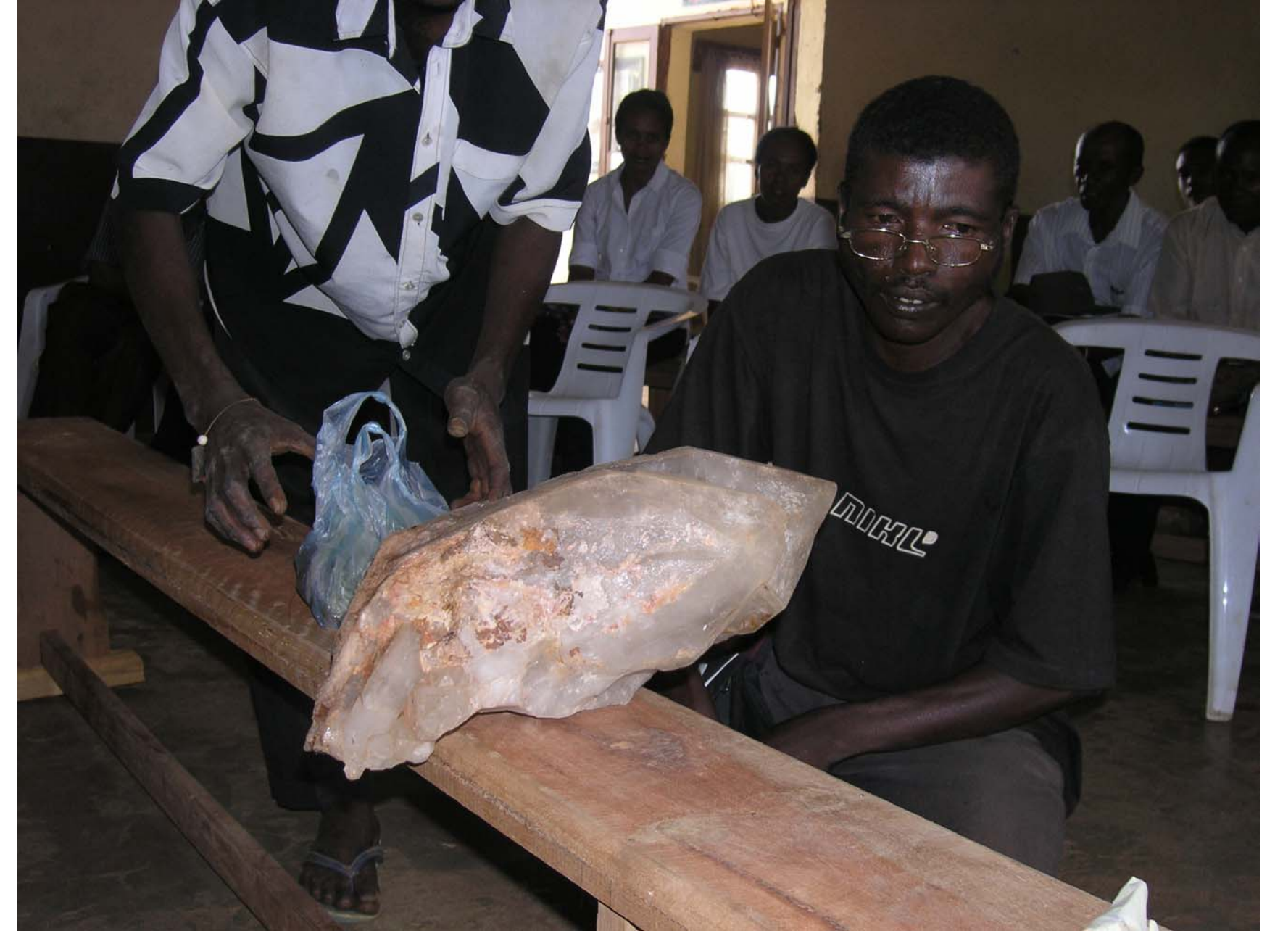
LOCAL MINER WITH ONE OF HIS QUARTZ CRYSTALS