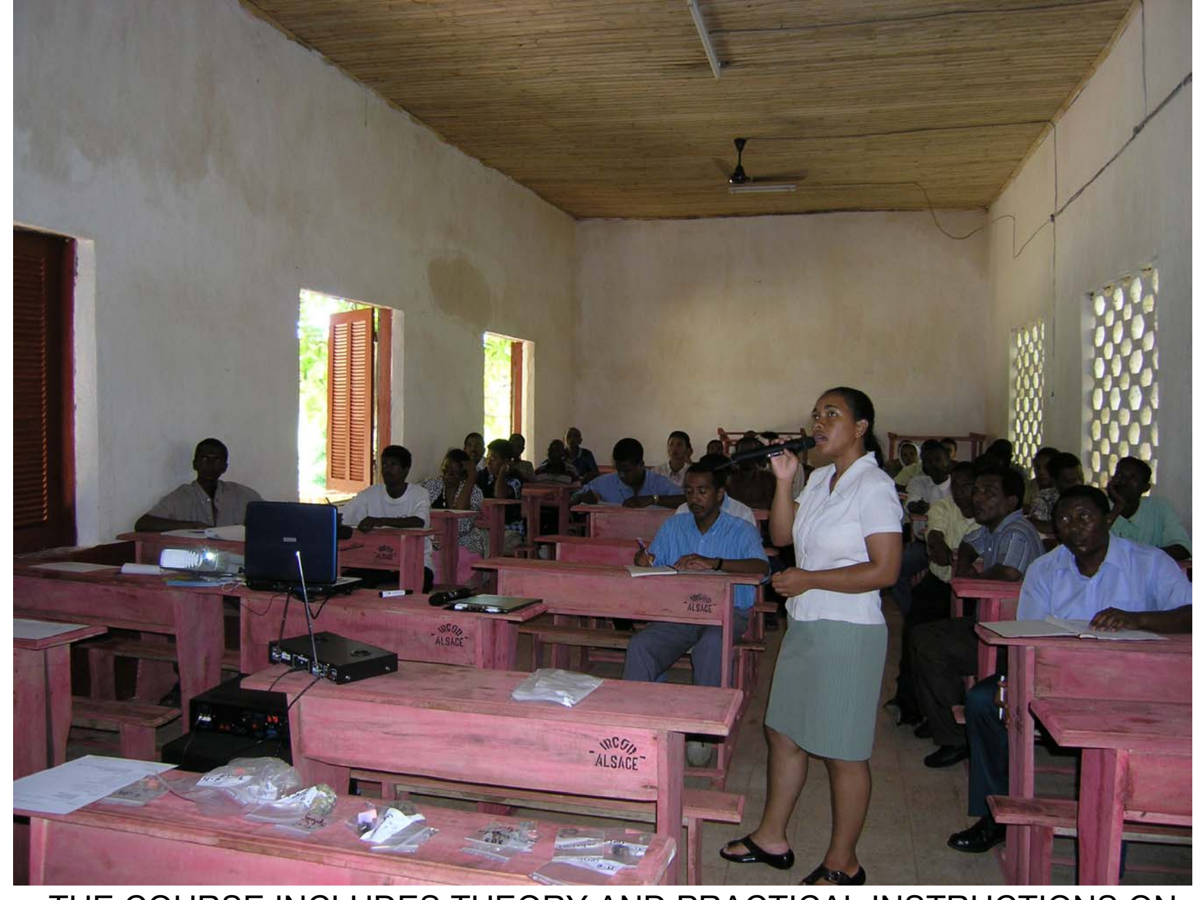
THE COURSE INCLUDES THEORY AND PRACTICAL INSTRUCTIONS ON ROUGH GEMSTONES