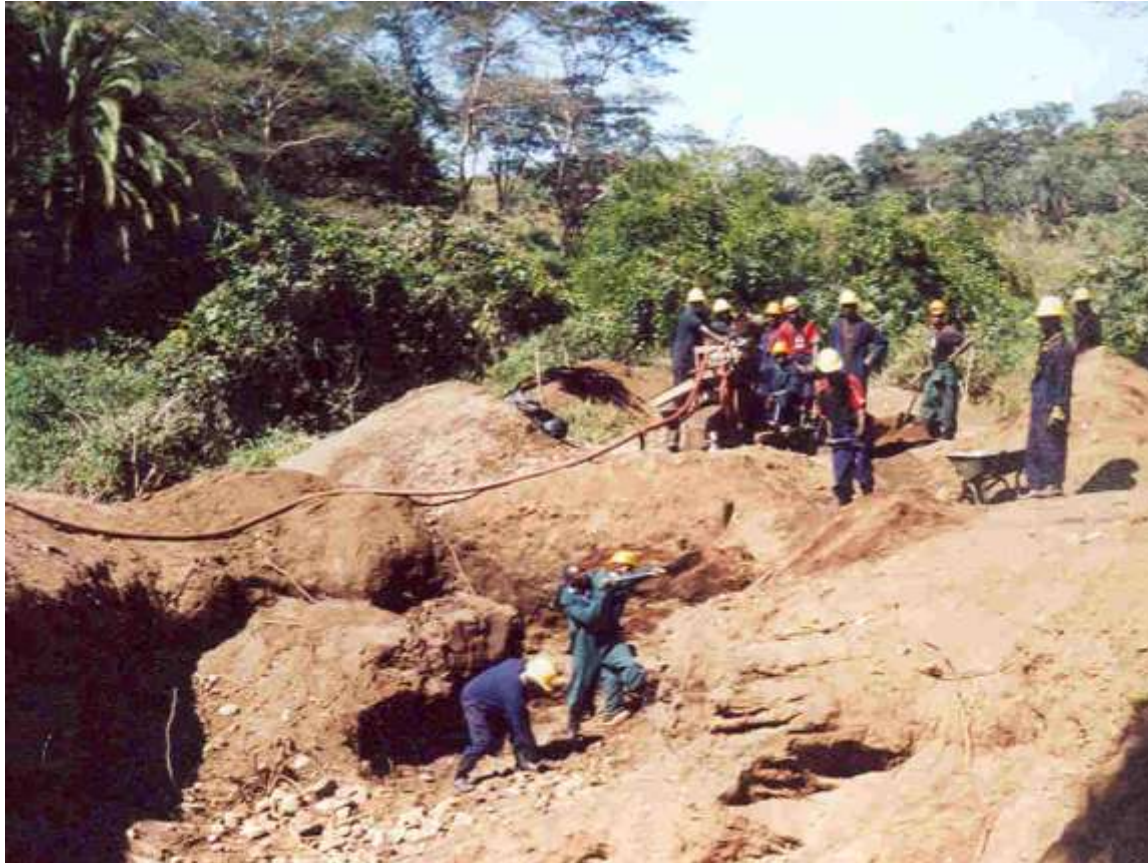
JULIES WITH WORKERS PUMPING WATER FROM THE PIT