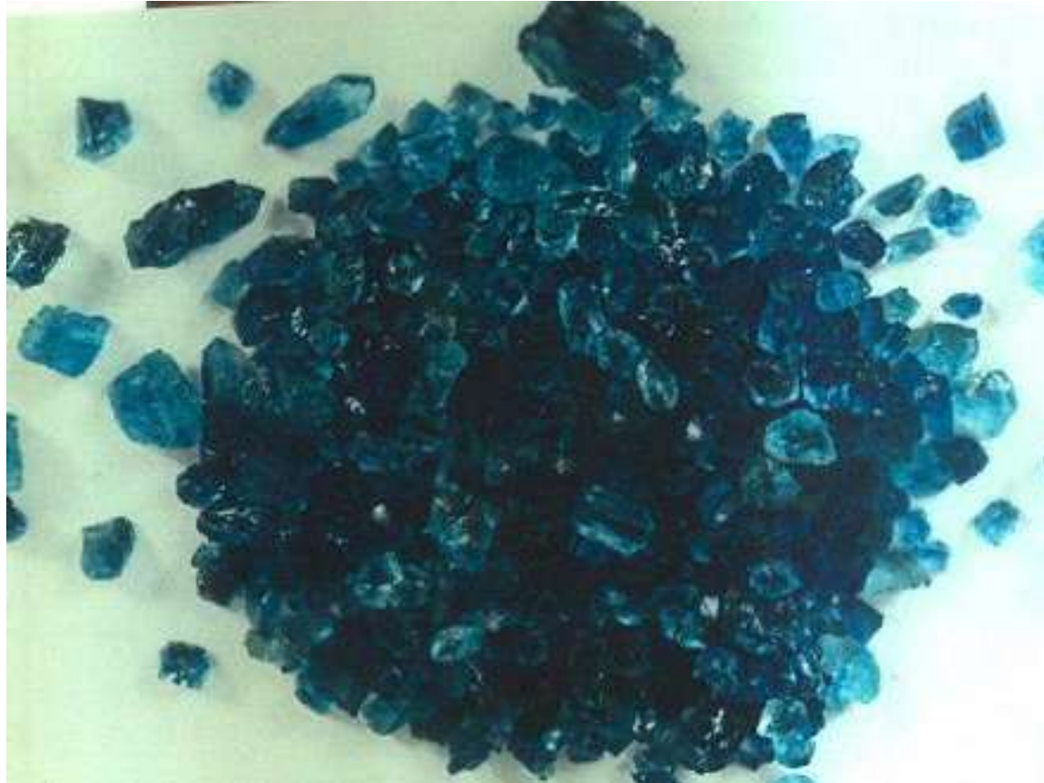
ACQUAMARINE PRODUCT FROM NAMAKAU'S MINE