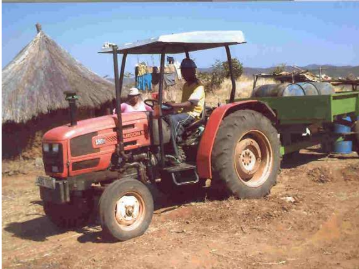
Mary heading to collect amethyst