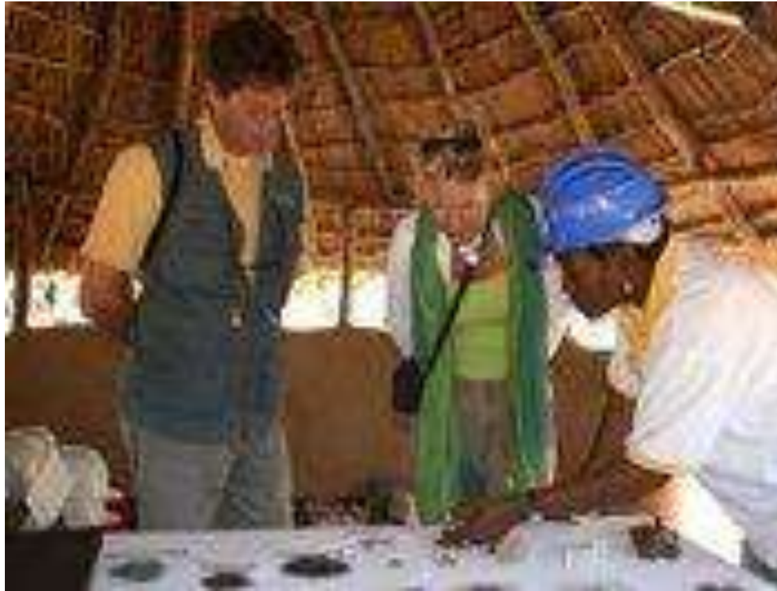
NAMAKAU EXPLAINING DIFFERENT TYPES OF GEMSTONES TO TOURISTS AT THE MINE