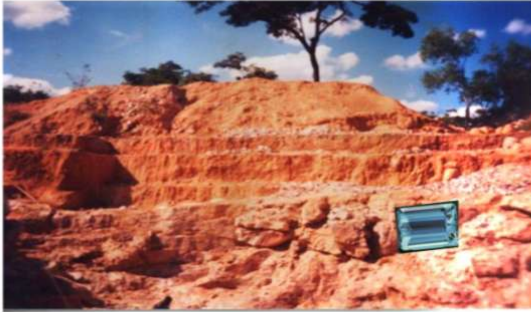
KAINGU AQUAMARINE MINE ITEZHI-TEZHI