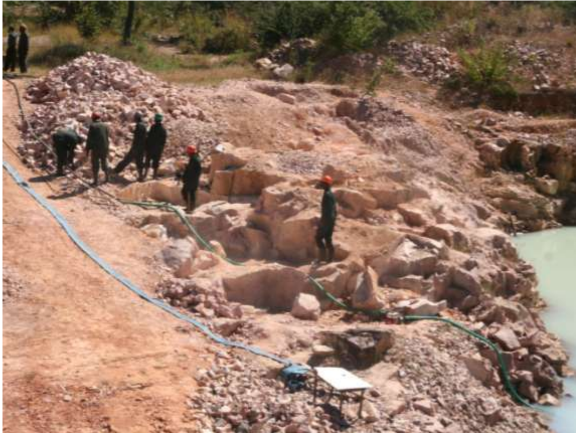
Rumping system/road way in the pit