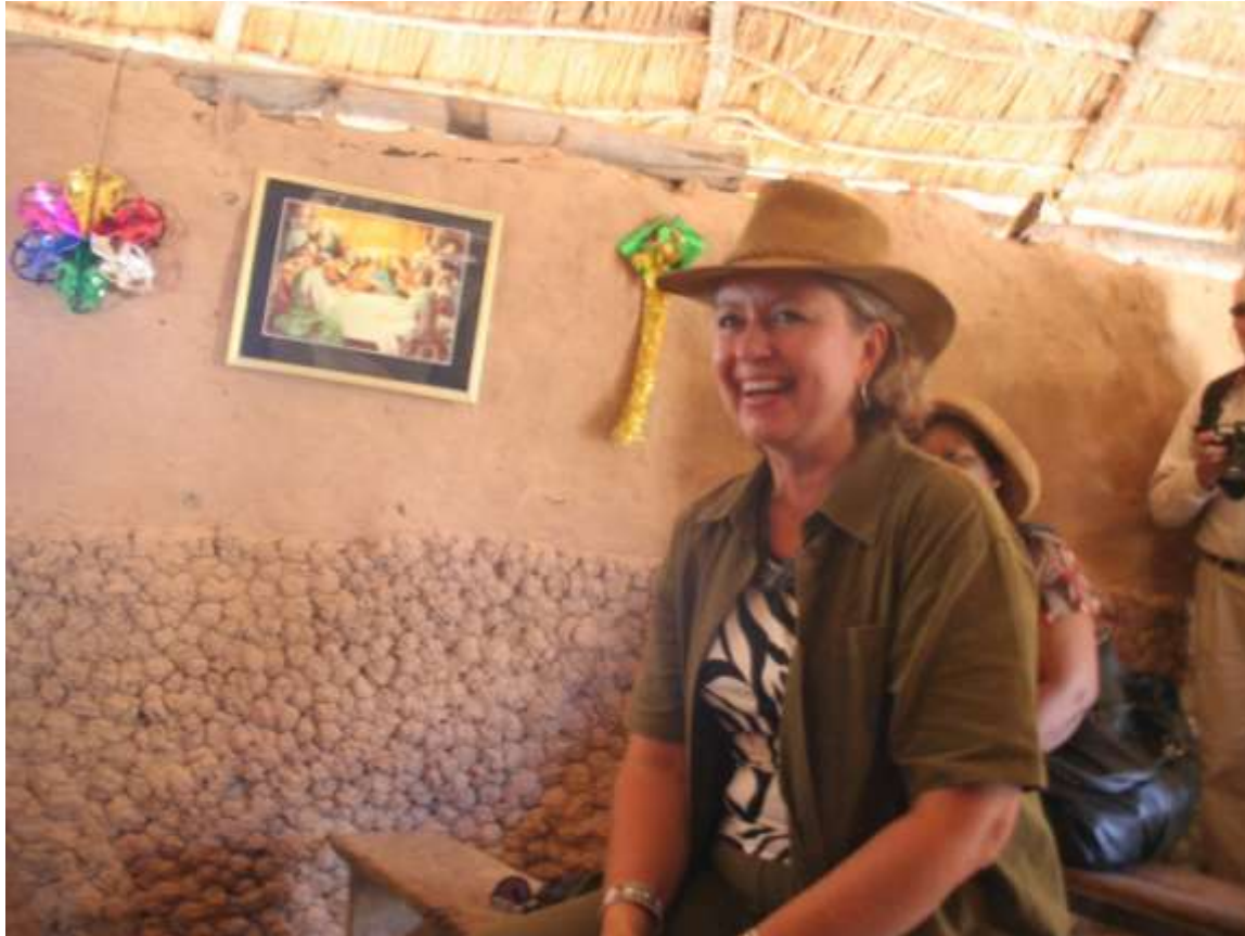
ONE OF THE TOURISTS IN OUR MINE CHURCH