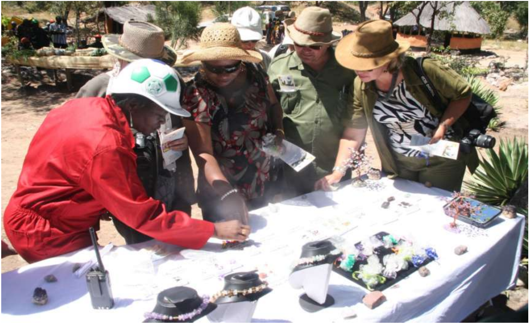
Tourists buying gems and jewellery after the tour