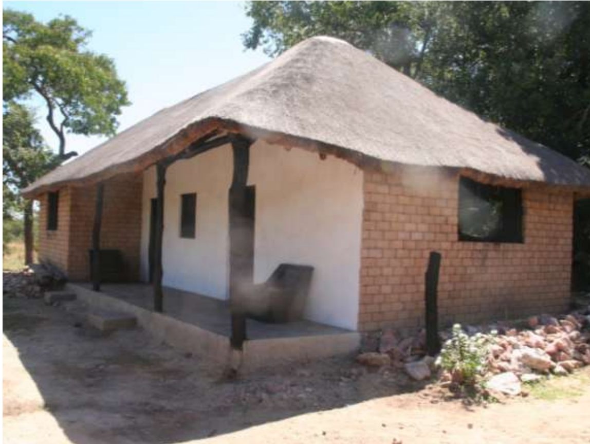
NAMAKAU'S NEW HOUSE