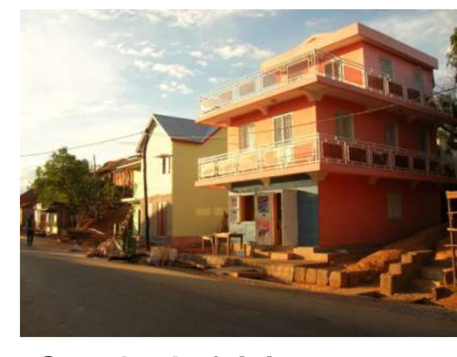
Standard of living ameliorated