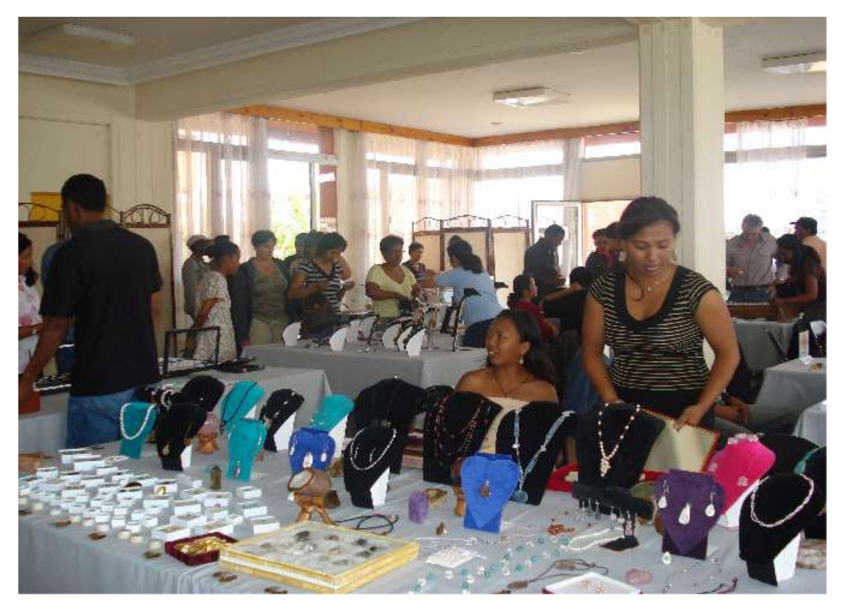
Madagascar Gemstone Market, MGM