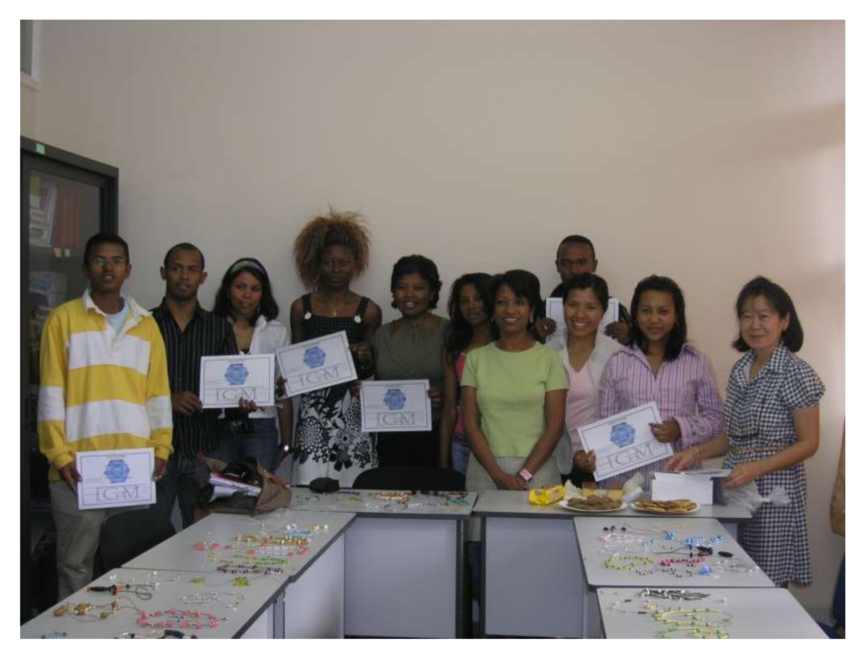
Students from different nationalities