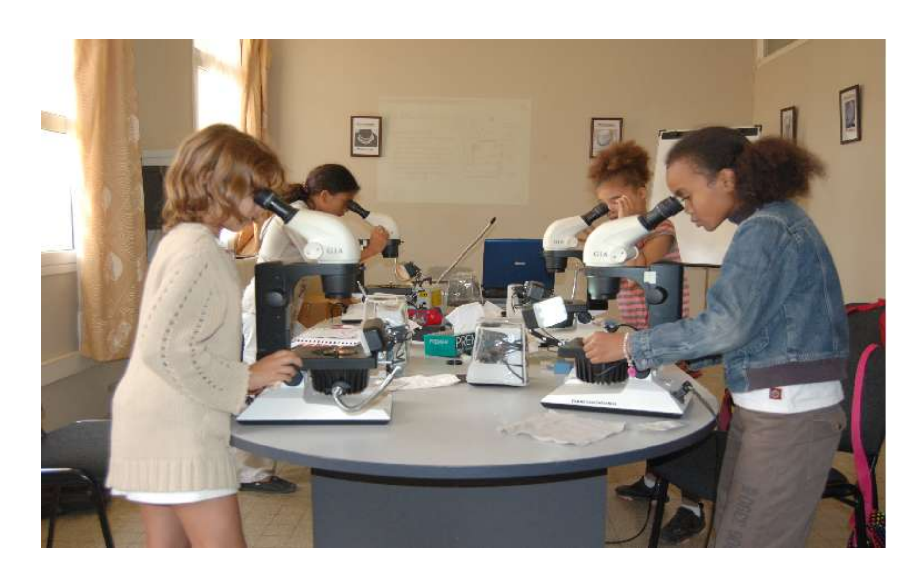
3-DAY GEMMOLOGY FOR KIDS