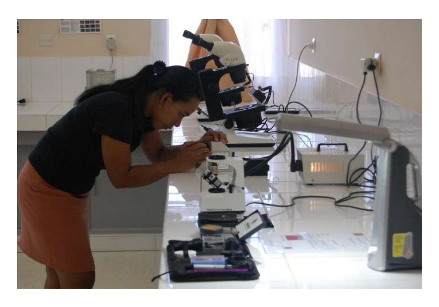
A laboratory technician working on a gemstone at the IGM laboratory