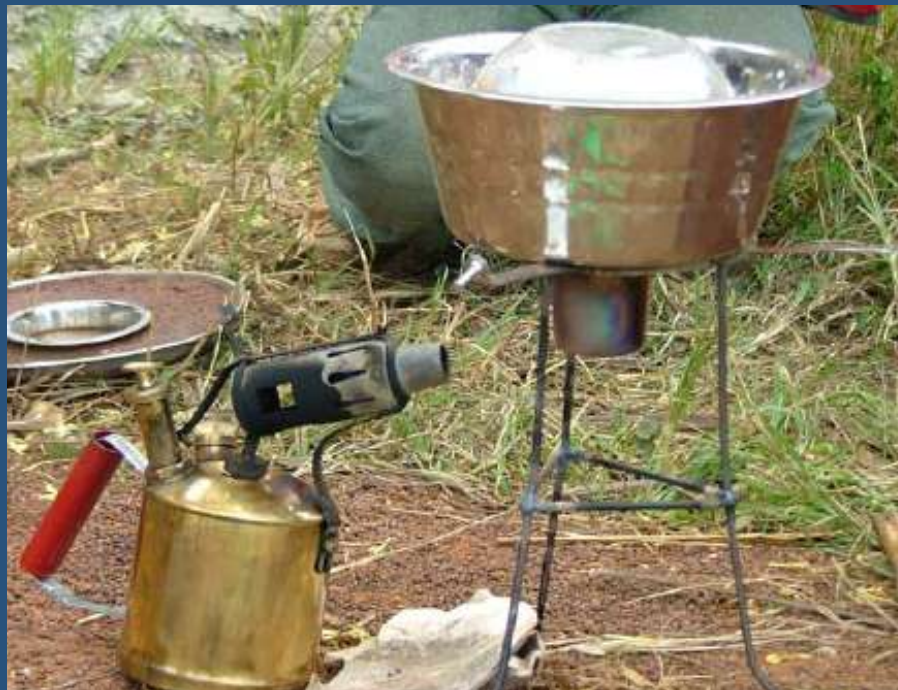
A locally fabricated retort