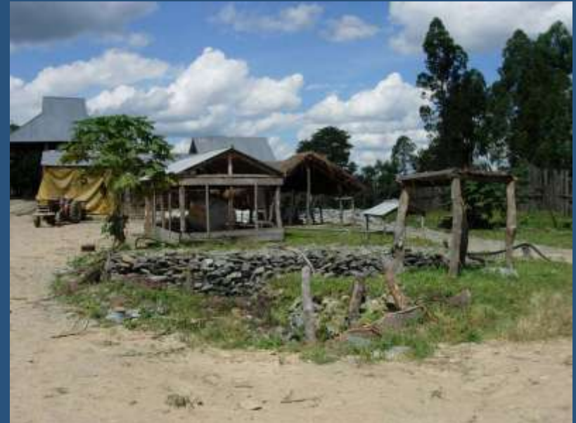
Blue Reef Small Scale Gold Mine (Tanzania)