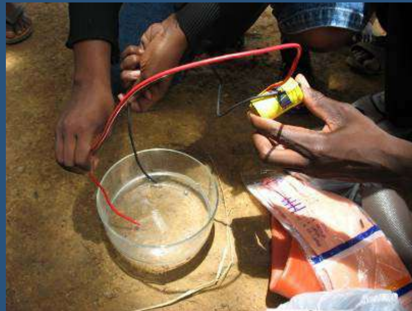
Miner re-activating mercury using a radio battery; the process takes about 10 - 20 minutes