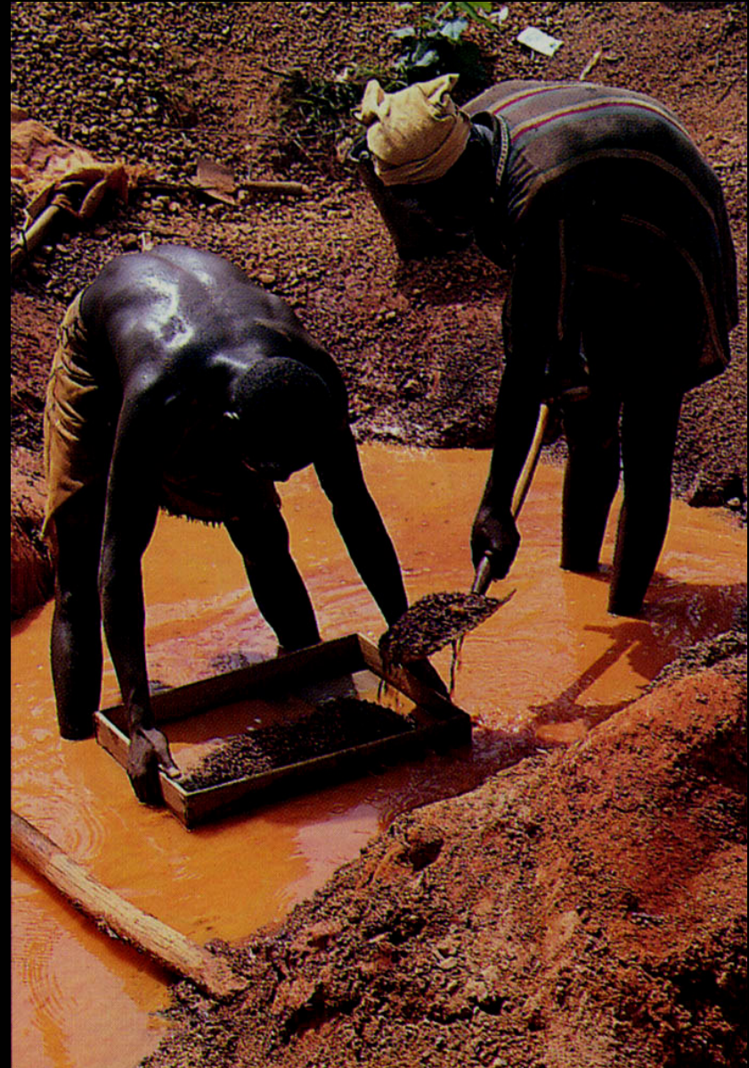
Working alluvial diamonds in Ghana