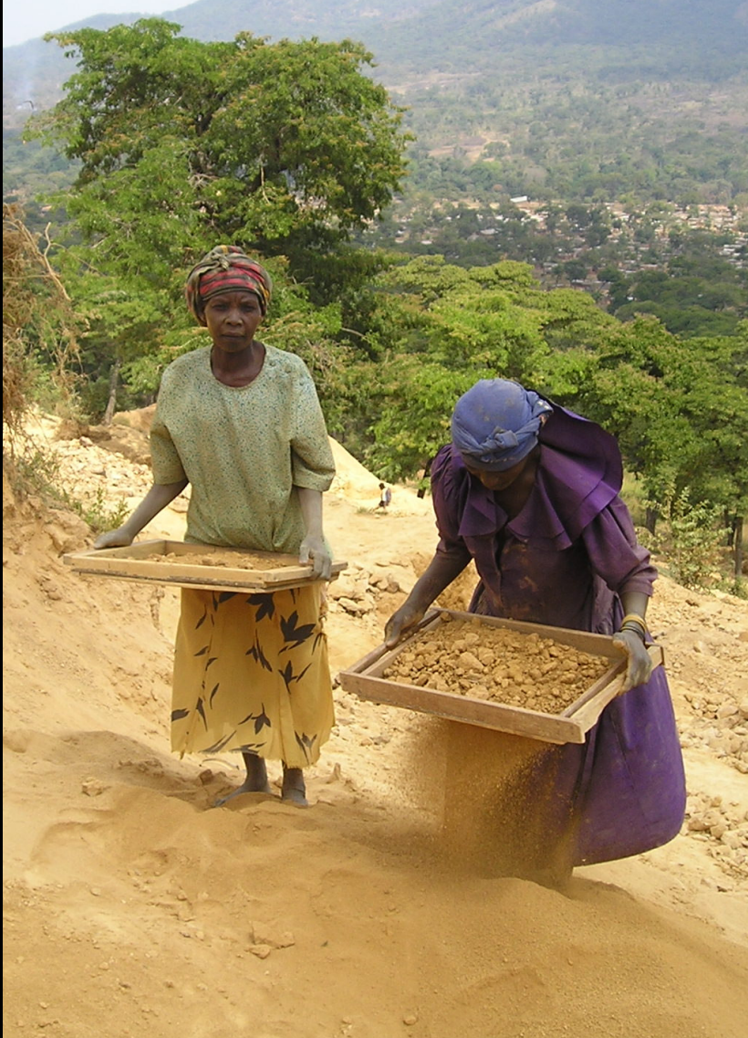
Women working on an artisanal gold site in Tanzania