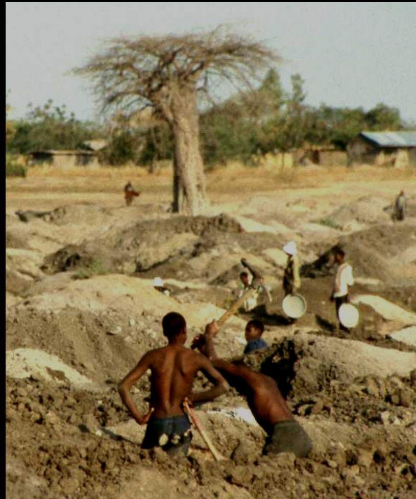
Artisanal gold mining (orpaillage) in Mali

Facilitating, Developing, Pioneering, Mobilizing RESPONSES