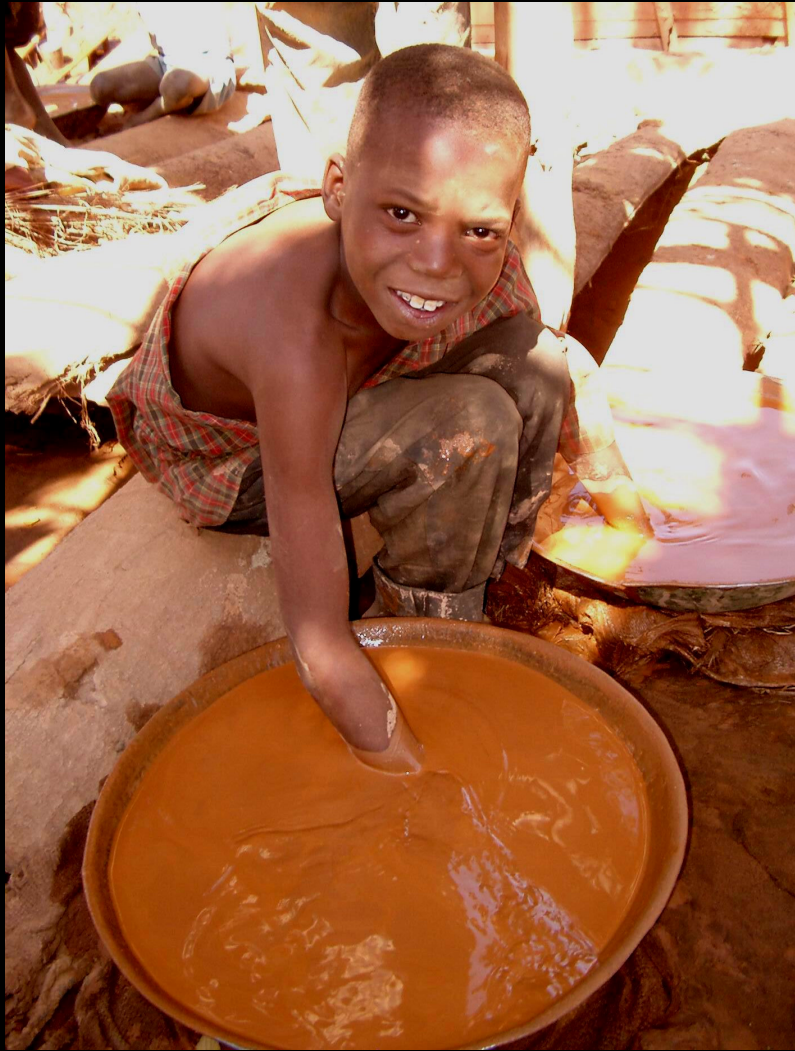
Child worker amalgamating gold in Guinée