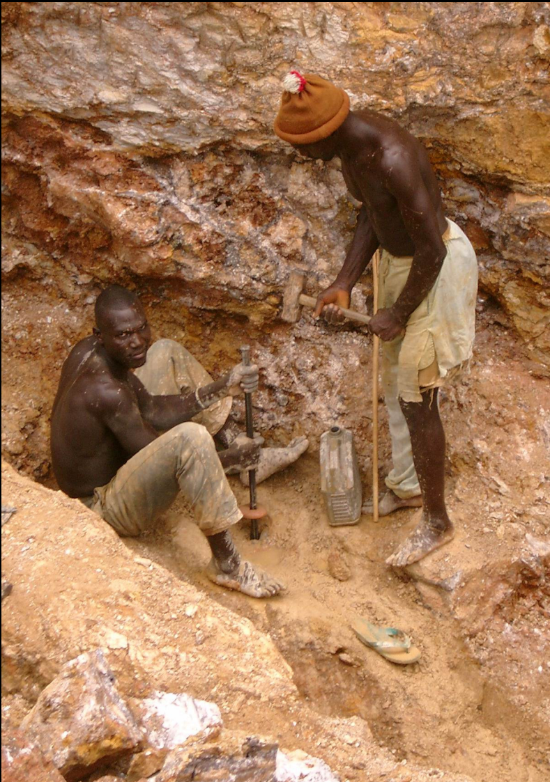
Artisanal mining for barytes in Nigeria