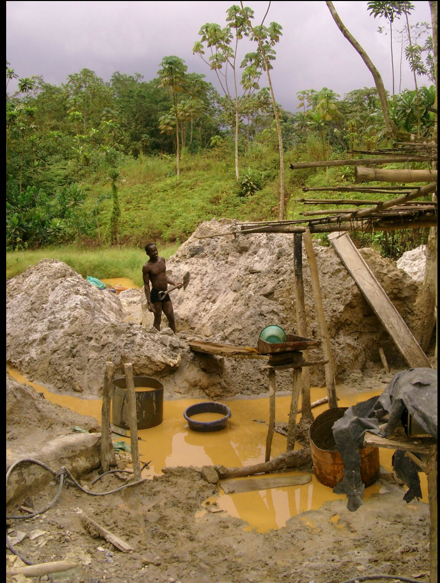
Artisanal mining (galemsey) for gold in Ghana