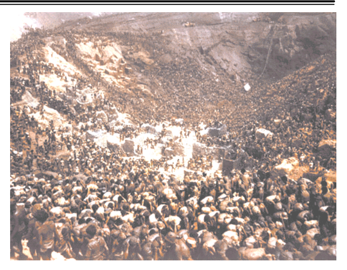
Serra Pelada. About 80,000 miners extracted 90 tonnes of gold from a single pit in the Brazilian Amazon

GMP is a collaborative initiative of GEF, UNDP, UNIDO and participating countries to assist to reduce mercury emissions from artisanal gold miners. The project is executed by UNIDO.