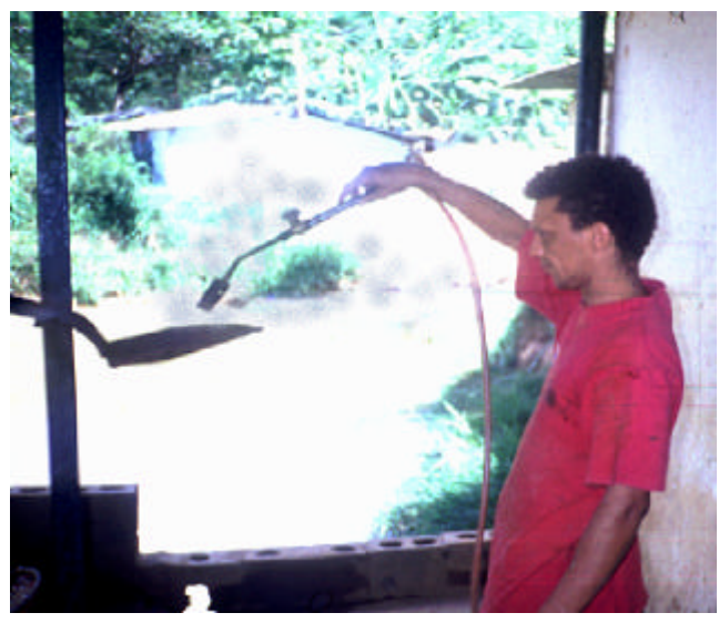
Venezuelan Miner burning amalgam to separate gold from mercury

Local people living near hot spot areas must be advised about the risks of consuming mercury polluted fish