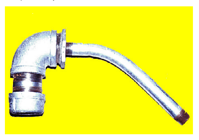
Retorts can reduce drastically mercury emissions Home-made retorts are not expensive. They can be made with water pipes and connections (devised by R. Hypolito)

As women have little knowledge of the hazards associated with mercury, they are often selected to work in the processing aspect of gold mining (including amalgamation). Women are also predominantly responsible for food preparation, and as women of childbearing age and children are particularly susceptible to methylmercury exposure from fish, educational programs should be specifically directed towards them.