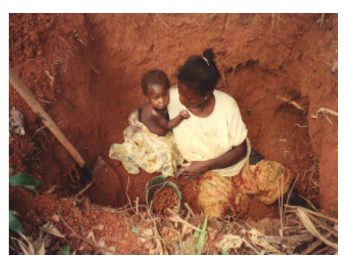
Artisanal Miner in Ghana with her baby

Although mercury use is illegal in most countries, amalgamation is the preferred method employed by artisanal gold miners. Mercury emissions from these activities are derived from poor practices, lack of knowledge about mercury toxicity and insufficient access to appropriate techniques. Environmental and health impacts resulting from the misuse of mercury and their effects on international waterbodies require coordinated actions and global responses.