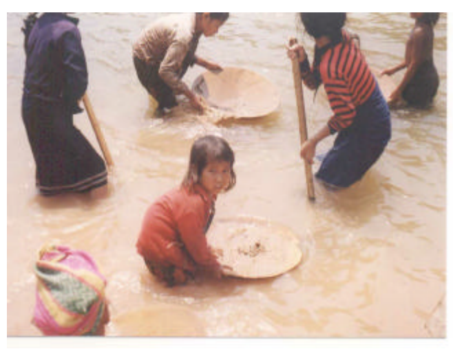
Women and children panning for gold in Laos

In August 2002, the GMP (Global Mercury Project) was initiated to help demonstrate ways of overcoming barriers to the adoption of best practices, waste minimization strategies and pollution prevention measures that limit contamination of the international waters. The Project funded by GEF and co-funded by UNDP and UNIDO is complemented by a suite of ongoing activities which are financed through either the participating countries' resources and/or bilateral programs.