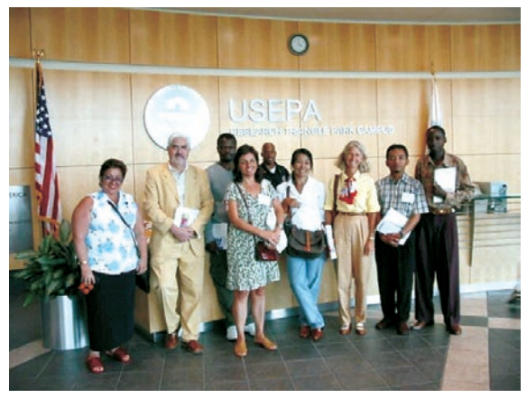
Training of lab technicians in using LUMEX

Training of lab technicians at US EPA in RTP North Carolina