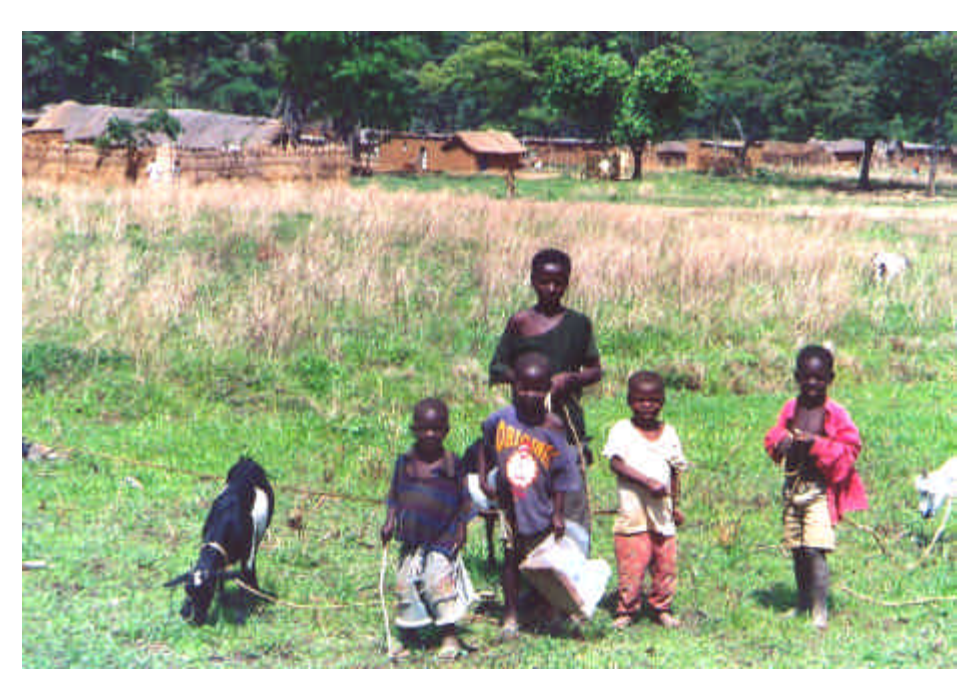
Fig. 6 – Kids from the mining community of Mgusu, Geita District