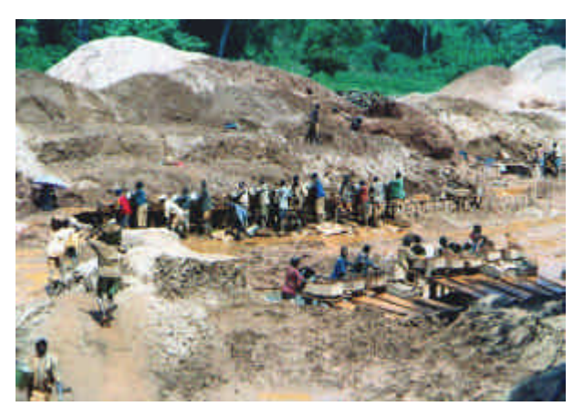
Fig. 1 – Sluice boxes with sisal liners in Mgusu

All kind of lining materials have been used in ASM around the world, for example old sacking, blanket, animal skin, velvet, a large variety of carpets, pieces of clothes, etc. All fibrous or hairy material can retain small particles of gold. The carpet mostly used in ASM operations in other parts of the world, including Ghana and Burkina Faso, is the 3M Nomad Dirt Scraper Matting in particular the type 8100 which consist of a coiled vinyl structure. This is good for coarse gold retention in the sluice boxes. The price of this carpet in ASM sites can reach up to US$ 40/m<sup>2</sup>. The