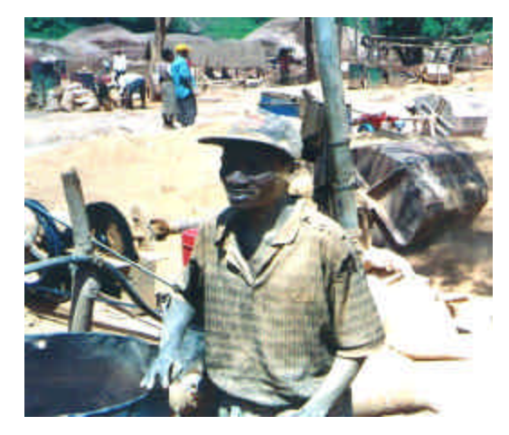
Fig. 2 – Dust is the main occupational health problem in the Geita region

Ø3.24cm. In other site the ball charge was: 30 balls of Ø9.70cm, 570 balls of Ø4.86cm, and 600 balls of Ø3.24cm. These loads seem to occupy more than the 35-40% of the mill volume which is normally recommended for dry grinding to provide mill volume for air sweeping and dust control<sup>6</sup>. The mills run at speeds between 32 and 43 rpm (exceptionally 20 rpm). The adequate speed should be around 70 to 75% of the critical speed: Nc = 76.63 D<sup>-0.5</sup> (D = mill diameter in feet) = 54 rpm. The balls mills are not sealed and there is a perforated steel plate in one side of the mill to discharge the ground product. The dust comes out in pulses and it is stacked underneath the mill. The sound is extremely loud. The operators and all